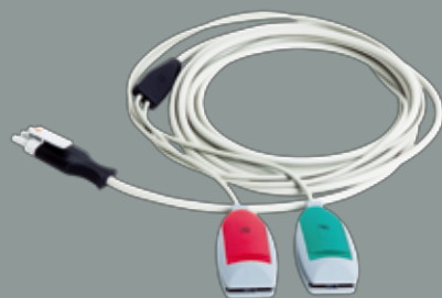
PRIMEDIC™ SavePads Connect cable , 2 pole for connecting PRIMEDIC™ SavePads Defibrillation electrodes for adults including cables and plugs