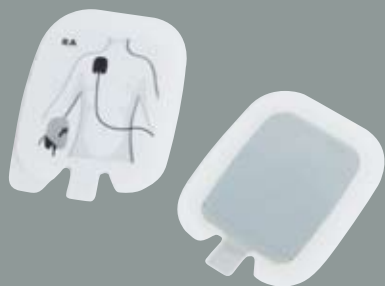
PRIMEDIC™ SavePads Connect (1 pair)