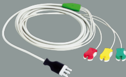
PRIMEDIC™ EKG patient cable 3 pole for connecting ECG electrodes for 6 channel ECG, including cables and plugs. Only for monitoring

Additional accessories available on request.